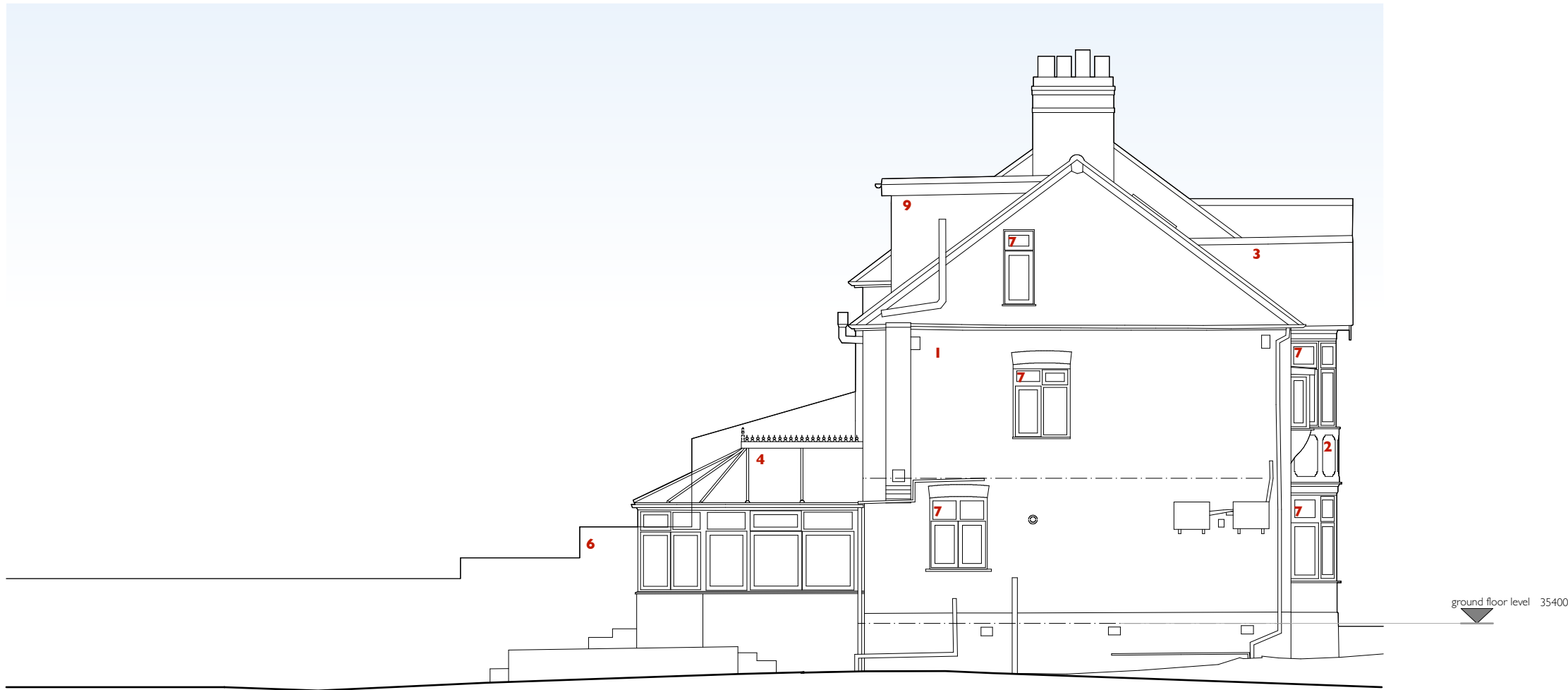
South Elevation - Existing (Pre Construction)