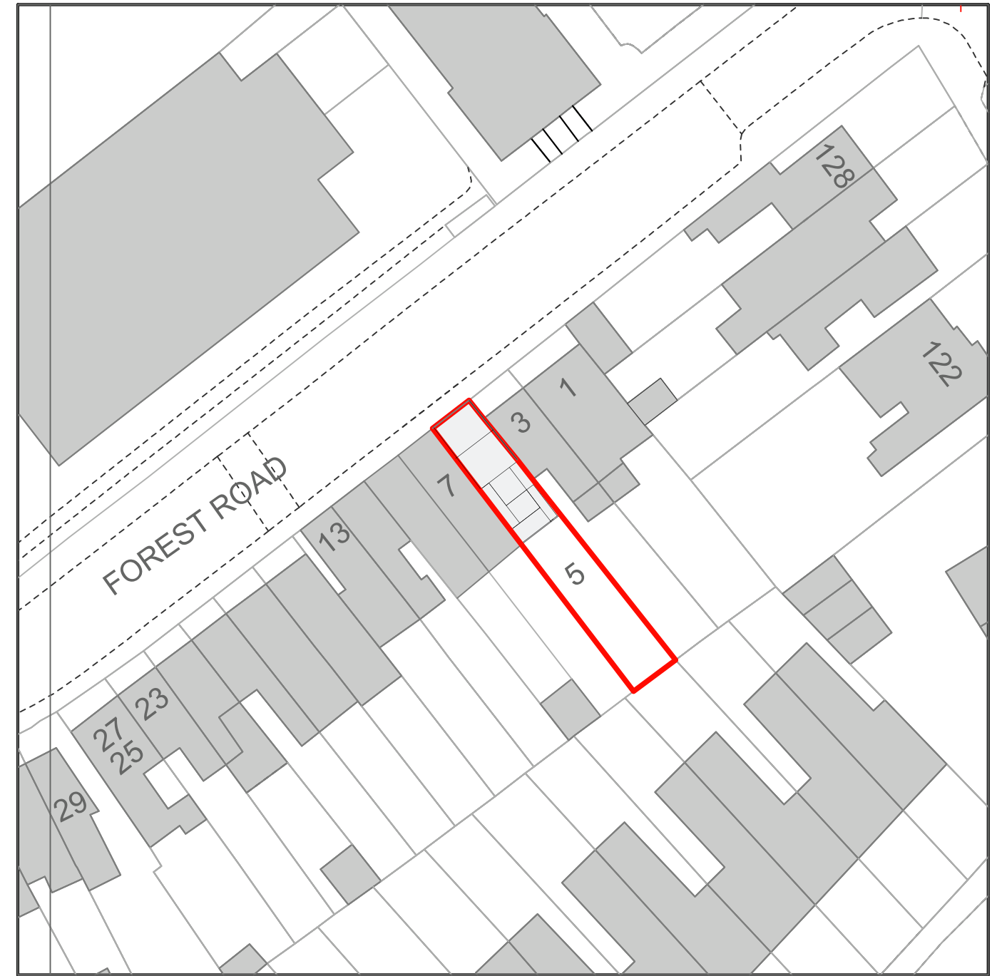
Existing Block Plan Site boundary outlined in red