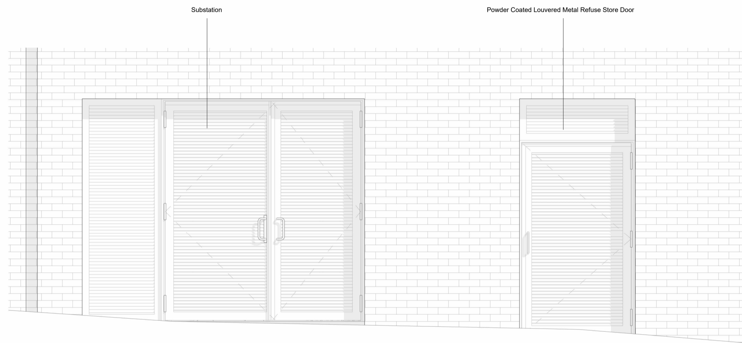
3 PROPOSED REFUSE STORE ELEVATION SCALE 1:25