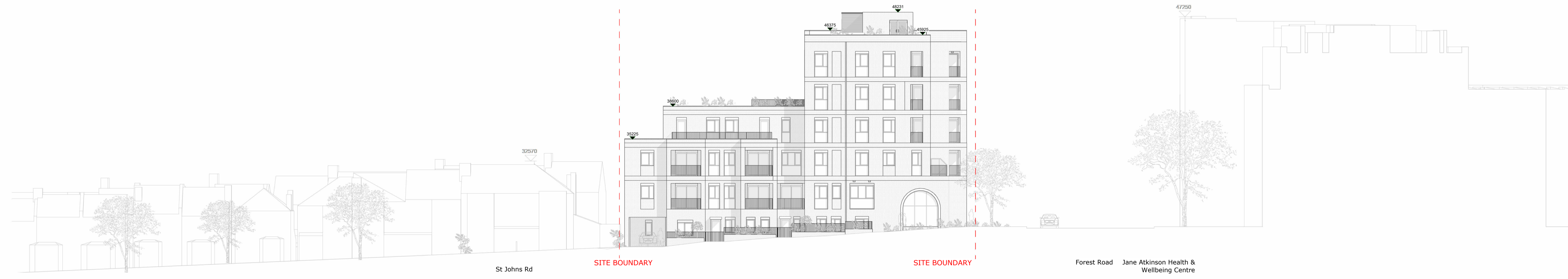
2 West Site Elevation 05106 SCALE 1:200

GENERAL NOTES 1. DO NOT SCALE – DIMENSIONS GOVERN. 2. ALL DIMENSIONS ARE IN MILLIMETERS UNLESS STATED OTHERWISE. 3. FARRELLS SHALL BE NOTIFIED OF ANY DISCREPANCIES IN WRITING. 4. REFER TO FARRELLS' DISCLAIMER AND CONDITIONS OF USE WHEN REFERRING TO INFORMATION ISSUED ELECTRONICALLY. COPYRIGHT AND ALL MORAL RIGHTS IN THE INFORMATION REMAINS WITH FARRELLS.