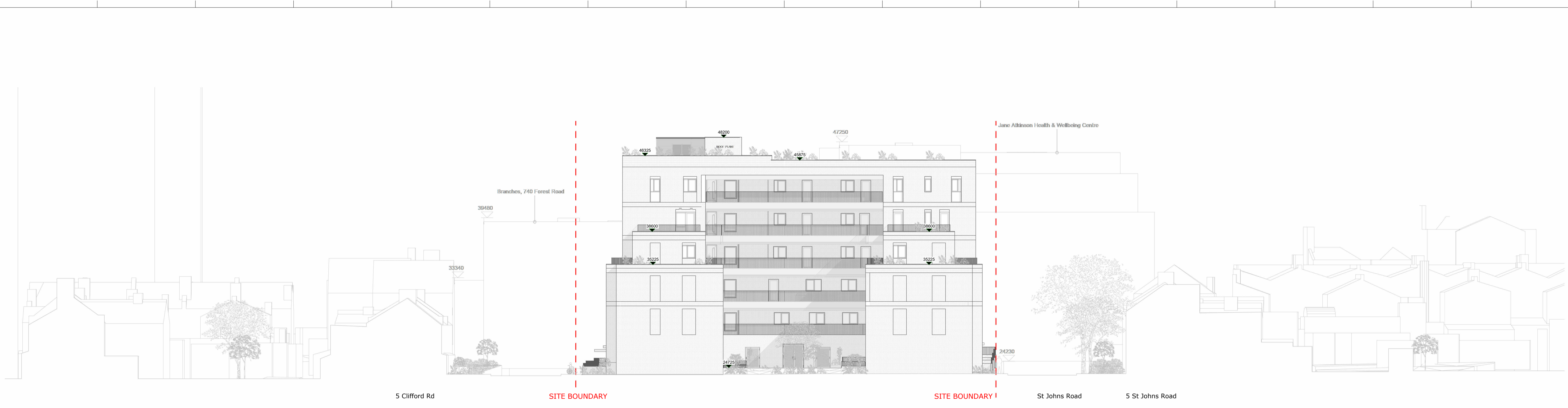
1 North Site Elevation 05106 SCALE 1:200