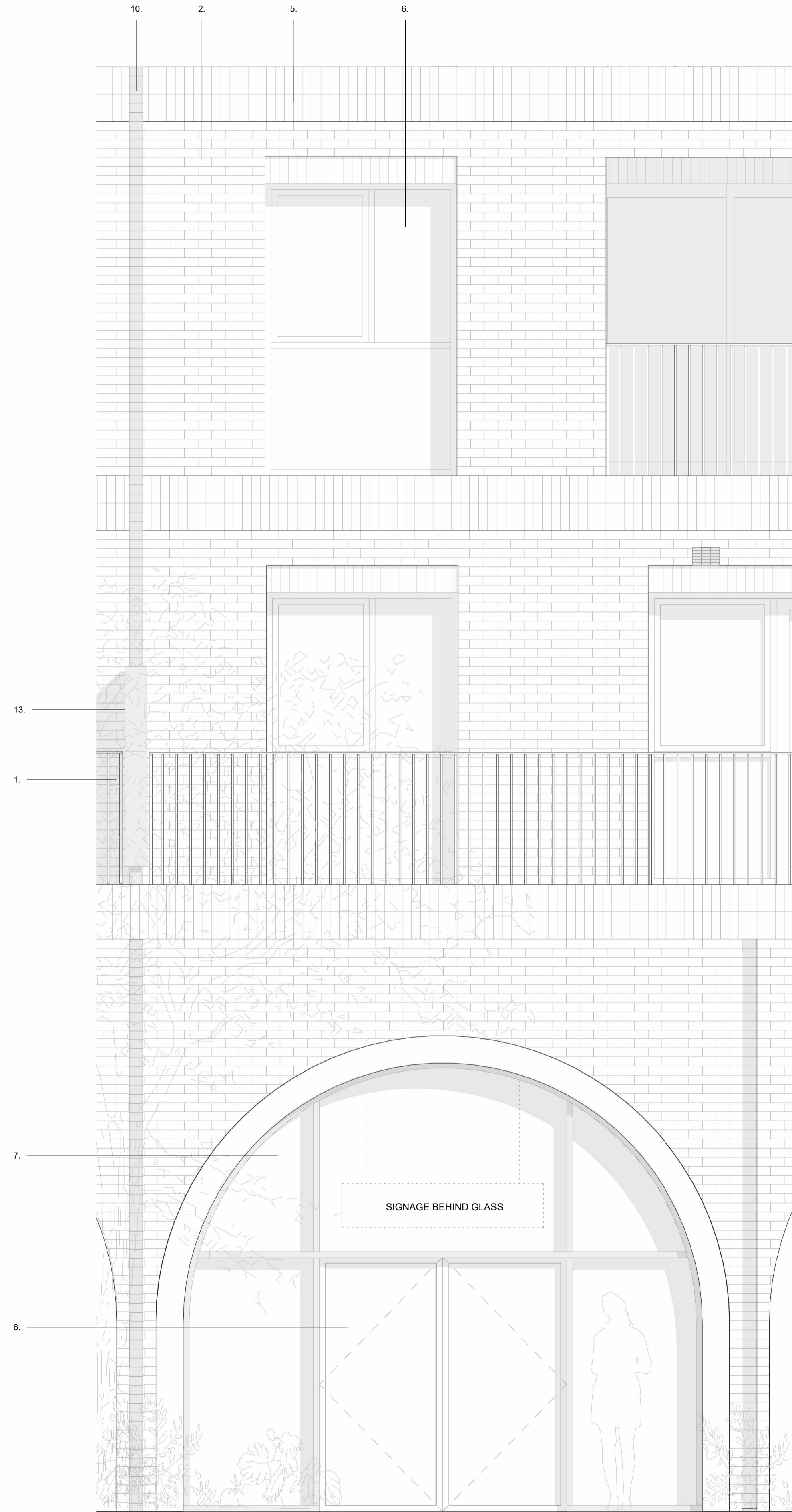
1 Commercial Arch Elevation SCALE 1:25

GENERAL NOTES 1. DO NOT SCALE - DIMENSIONS GOVERN. 2. ALL DIMENSIONS ARE IN MILLIMETERS UNLESS STATED OTHERWISE. 3. FARRELLS SHALL BE NOTIFIED OF ANY DISCREPANCIES IN WRITING. 4. REFER TO FARRELLS' DISCLAIMER AND CONDITIONS OF USE WHEN REFERRING TO INFORMATION ISSUED ELECTRONICALLY. 5. COPYRIGHT AND ALL MORAL RIGHTS IN THE INFORMATION REMAINS WITH FARRELLS.