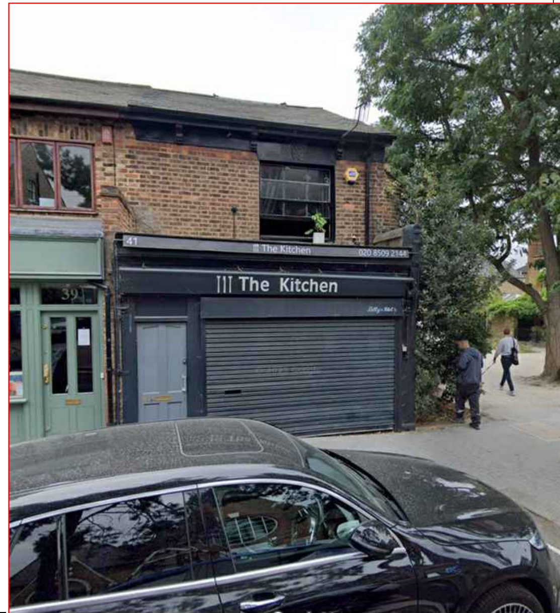
EXISTING FRONT ELEVATION VIEW

PLEASE NOTE 1. All dimensions to be verified on site. 2. All dimensions are in millimeters. 3. No work shall commence until all approvals and agreements have been obtained. These include, Planning, Building Regulations, Water and party Wall. 4. The Copyright of this drawing belong to Phaaraspa Design Studio Ltd