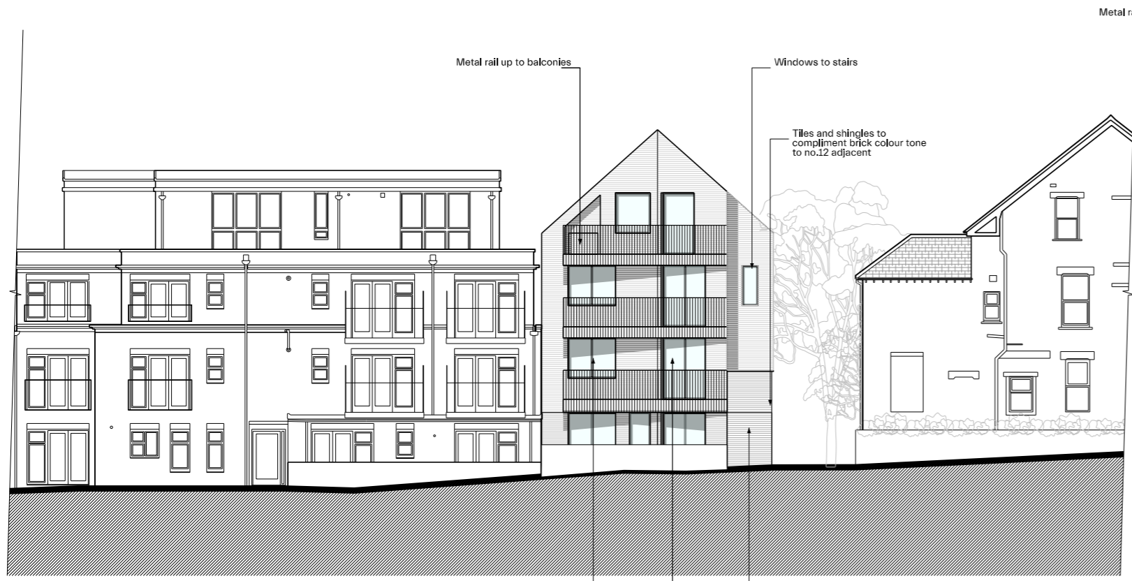
Block B Proposed Elevation B (Rear)