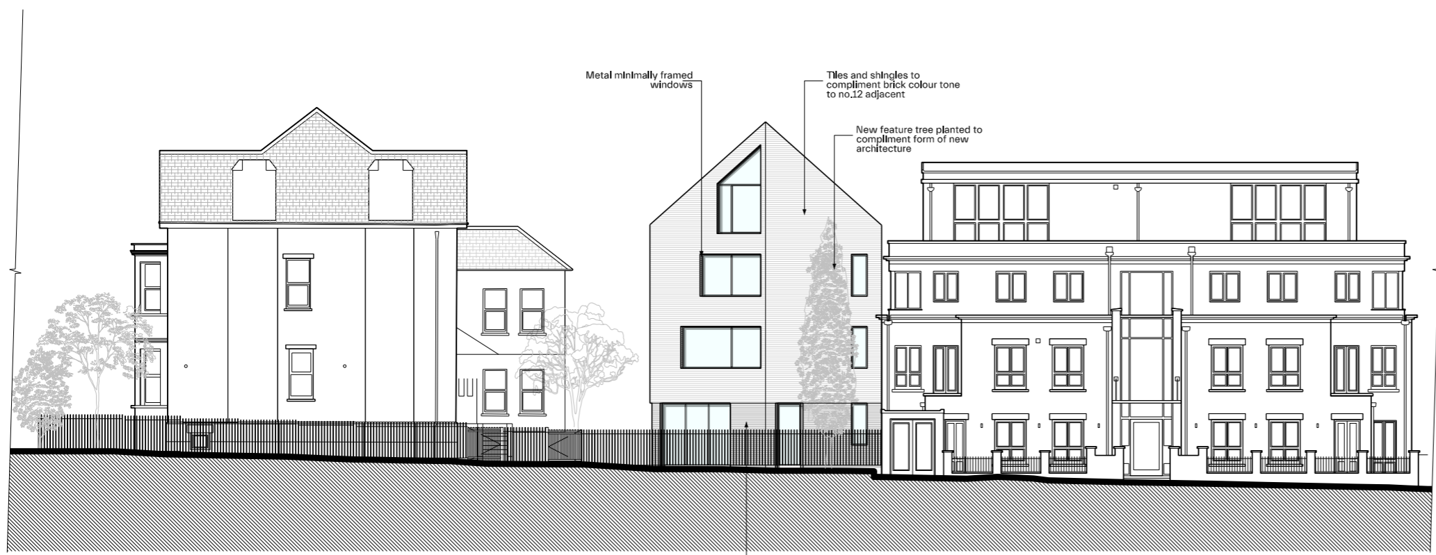
Block B Proposed Elevation A (Front)