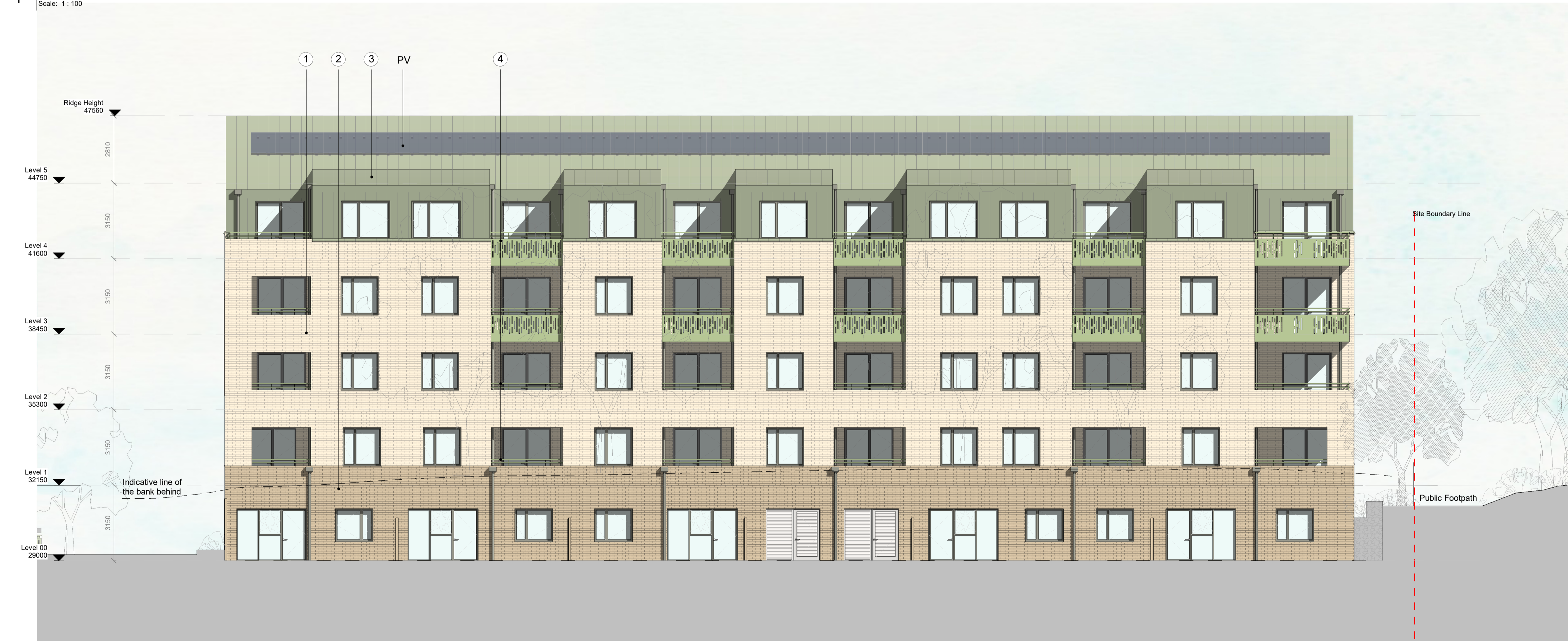
3 South Elevation Scale: 1 : 100

GENERAL NOTES: This drawing is © 2019 Pollard Thomas Edwards LLP (PTE). Use figured dimensions only. DO NOT SCALE. All dimensions are in millimetres unless noted otherwise. This drawing must be read in conjunction with all other relevant drawings and specifications from the Architect and other consultants. If in doubt, ask. SETTING OUT NOTES: All setting out to be confirmed on site prior to construction - any discrepancy must be immediately reported to the Architect. All setting out to face of structure or to grid. All partitions set out to studwork or structure. For setting out and specification of M&E services refer to M&E Consultants documents. For setting out and specification of structure refer to Structural Engineer's documents.