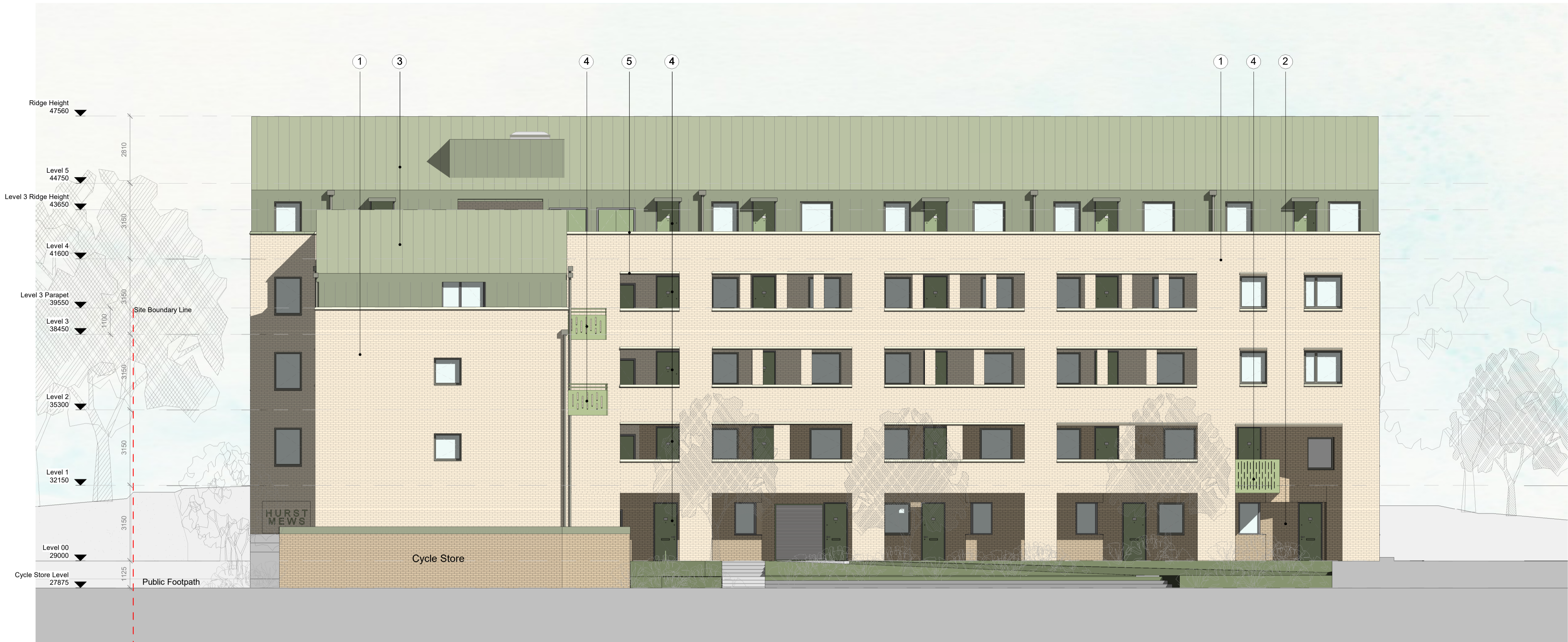
1 North Elevation Scale: 1 : 100