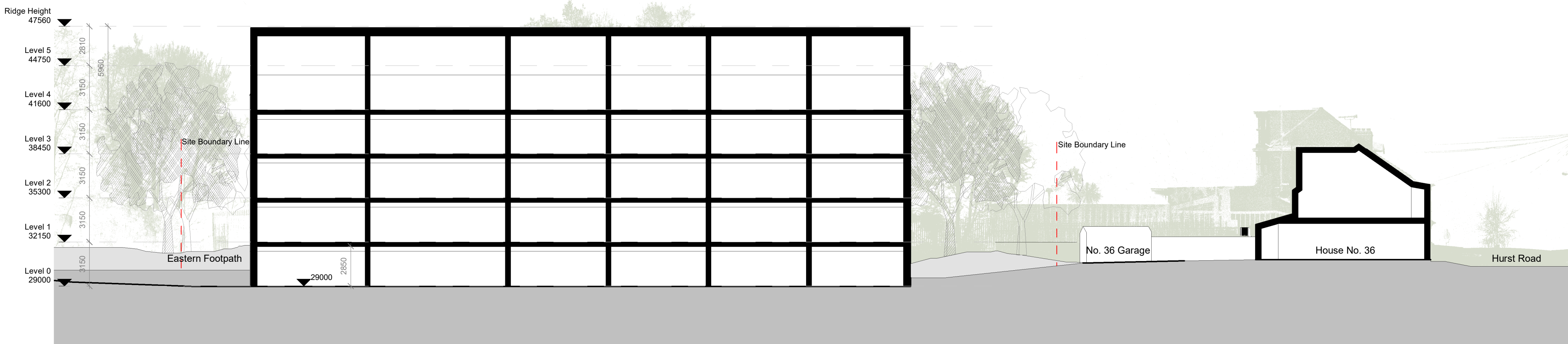
Section 2 Scale: 1 : 200