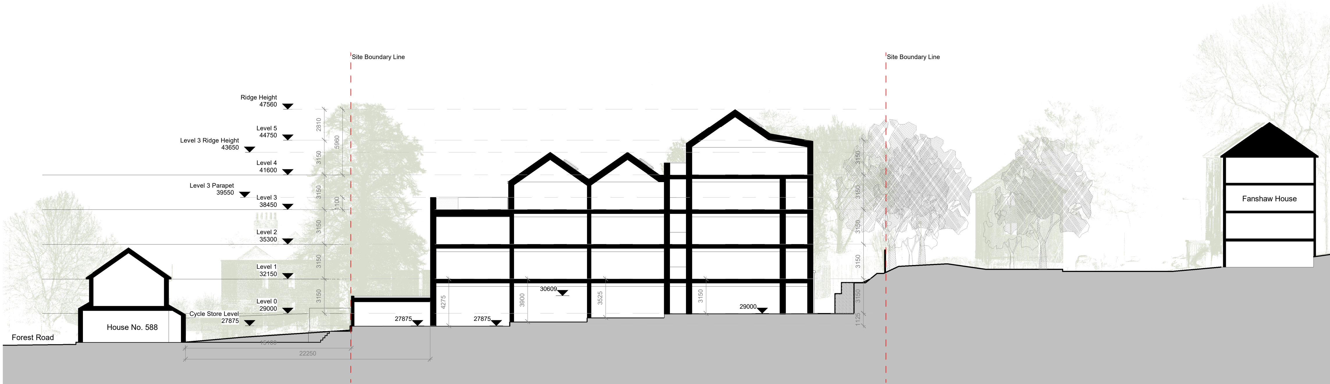
Section 1 Scale: 1 : 200