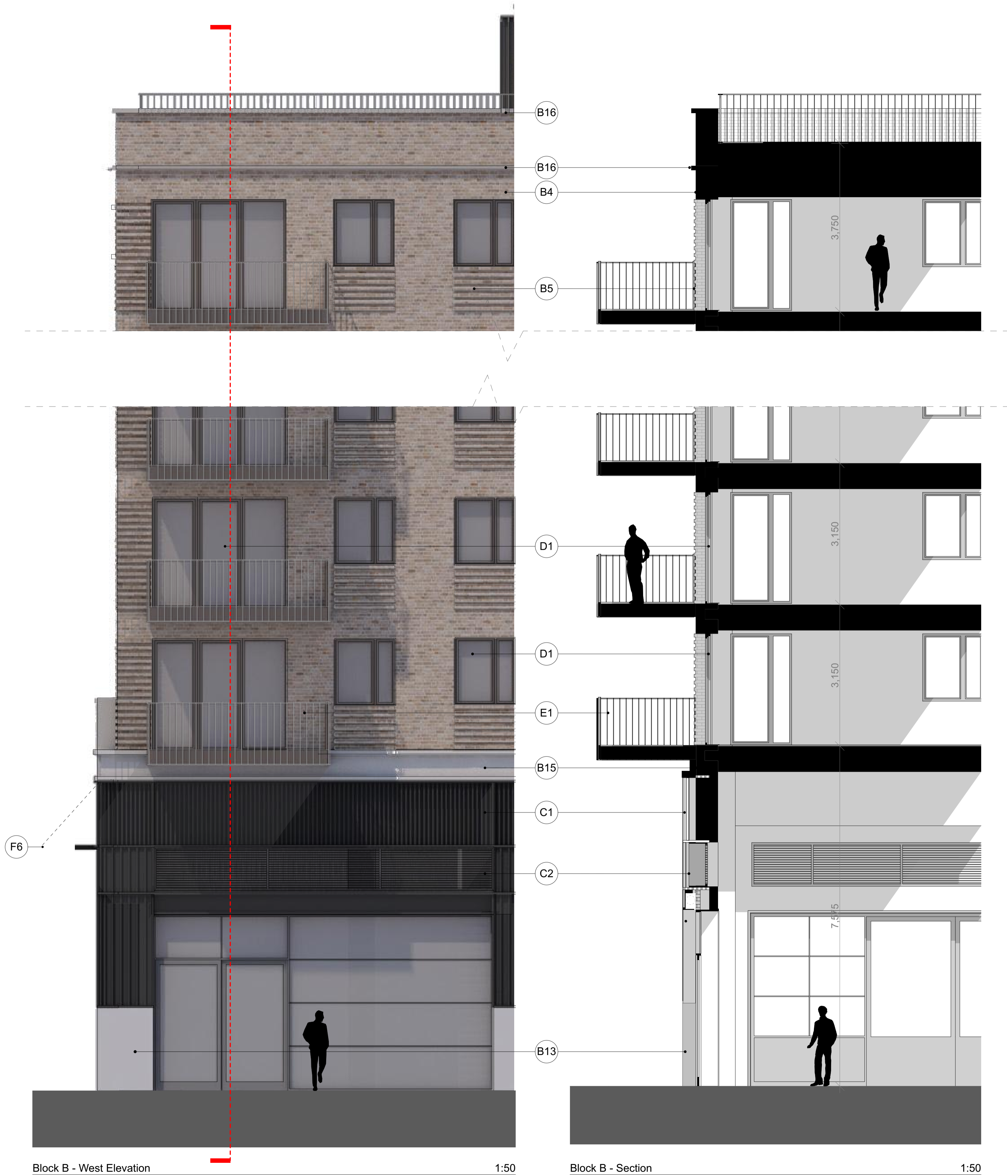
Block B - West Elevation