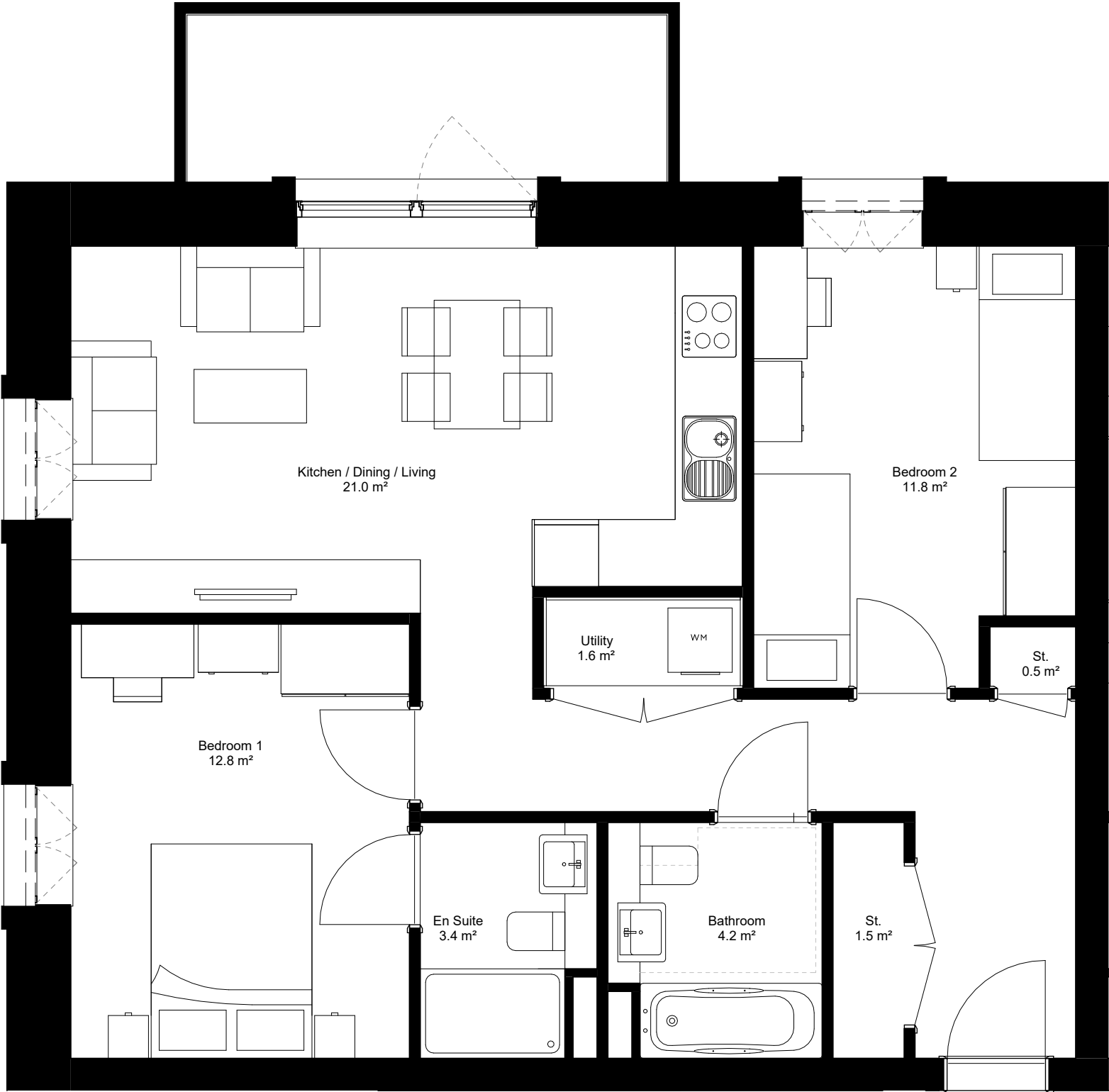
Proposed Dwelling Type - P2404 1 : 50