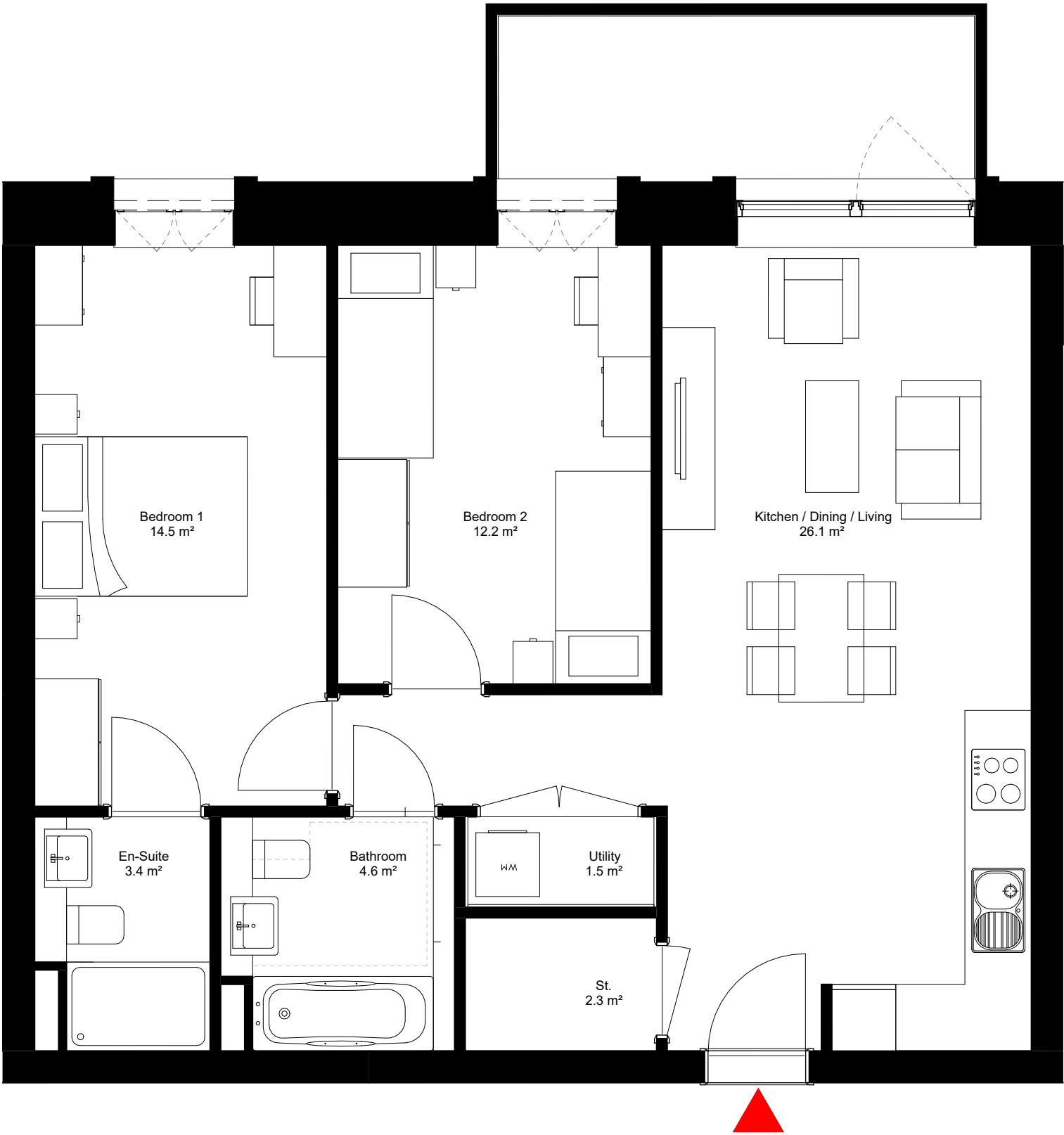
Proposed Dwelling Type - P2402 1 : 50