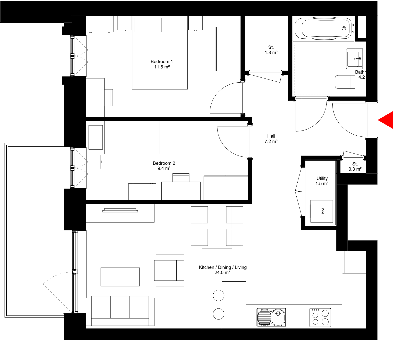
Proposed Dwelling Type - P2301 1 : 50