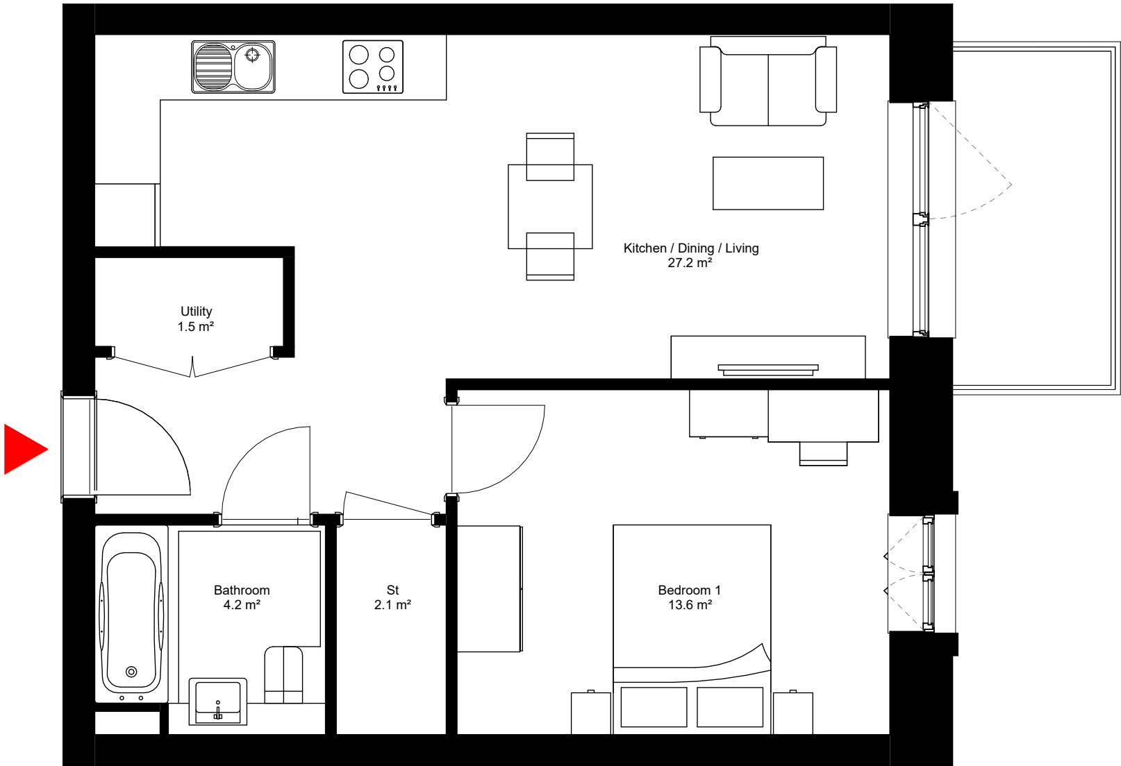
Proposed Dwelling Type - P1202 1 : 50