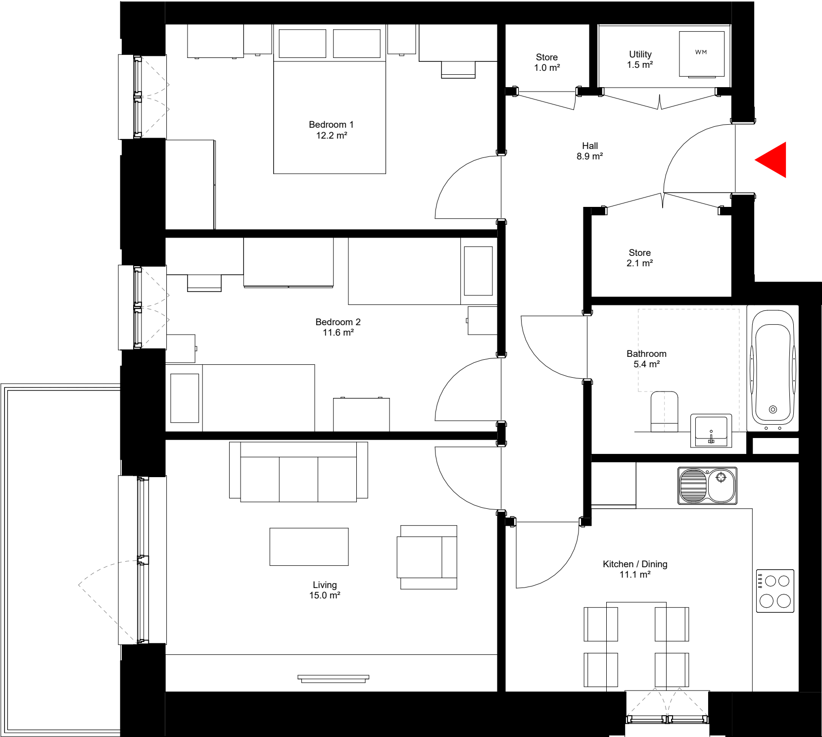
Proposed Dwelling Type - A2402 1 : 50