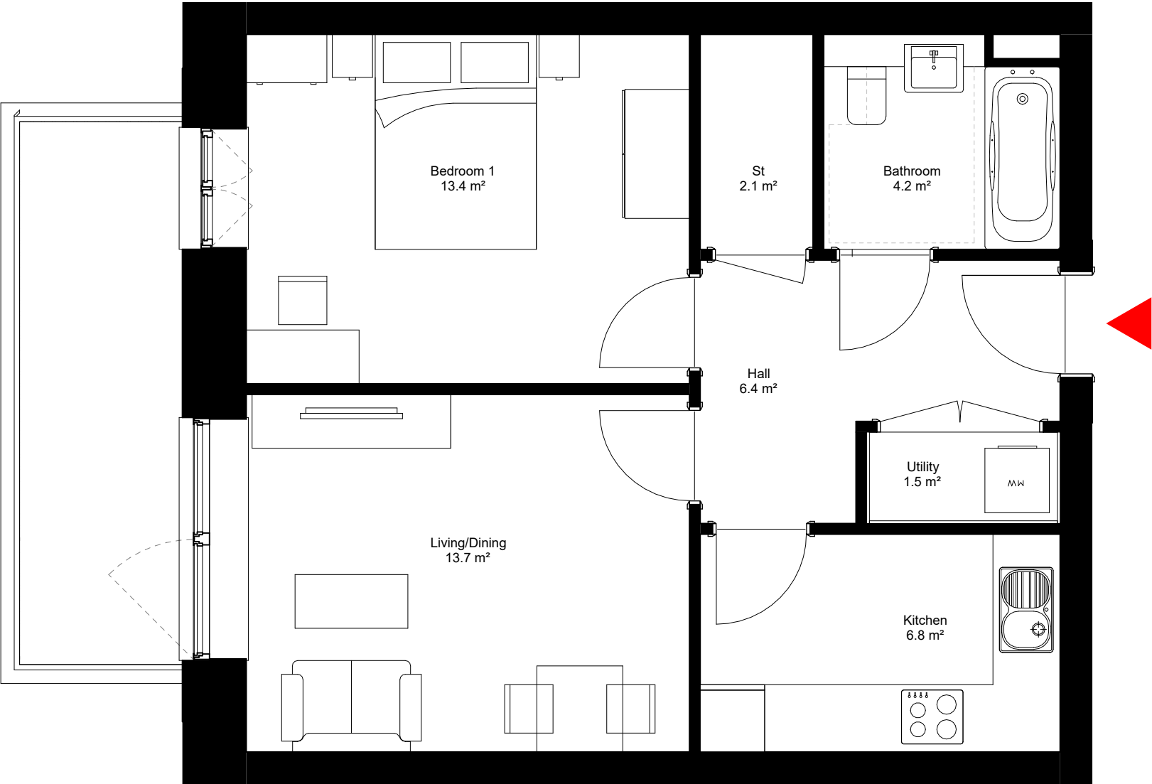
Proposed Dwelling Type - A1202 1 : 50