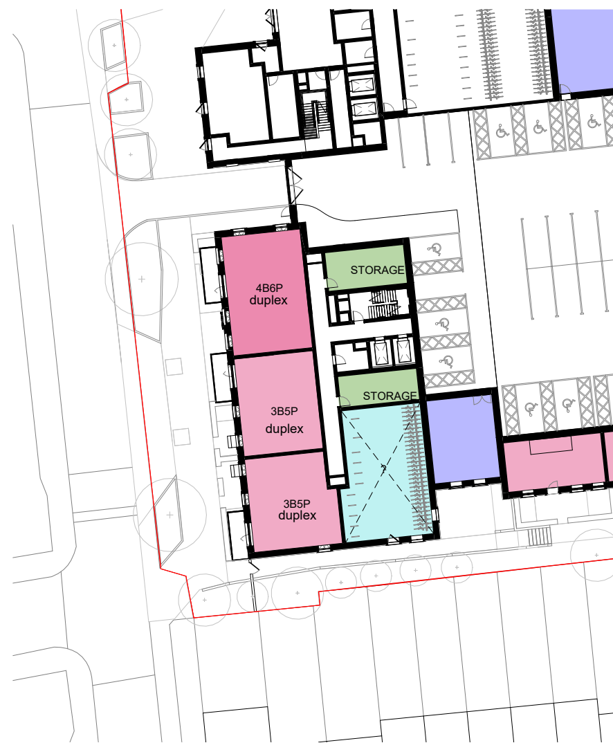
Plot C2 - Mezzanine Level 1 : 500