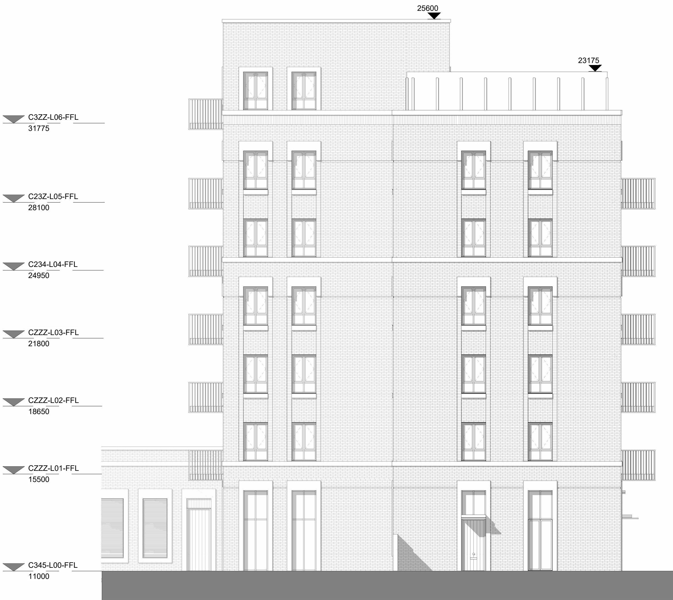
Proposed Plot C Block 3 South Elevation 1 : 100