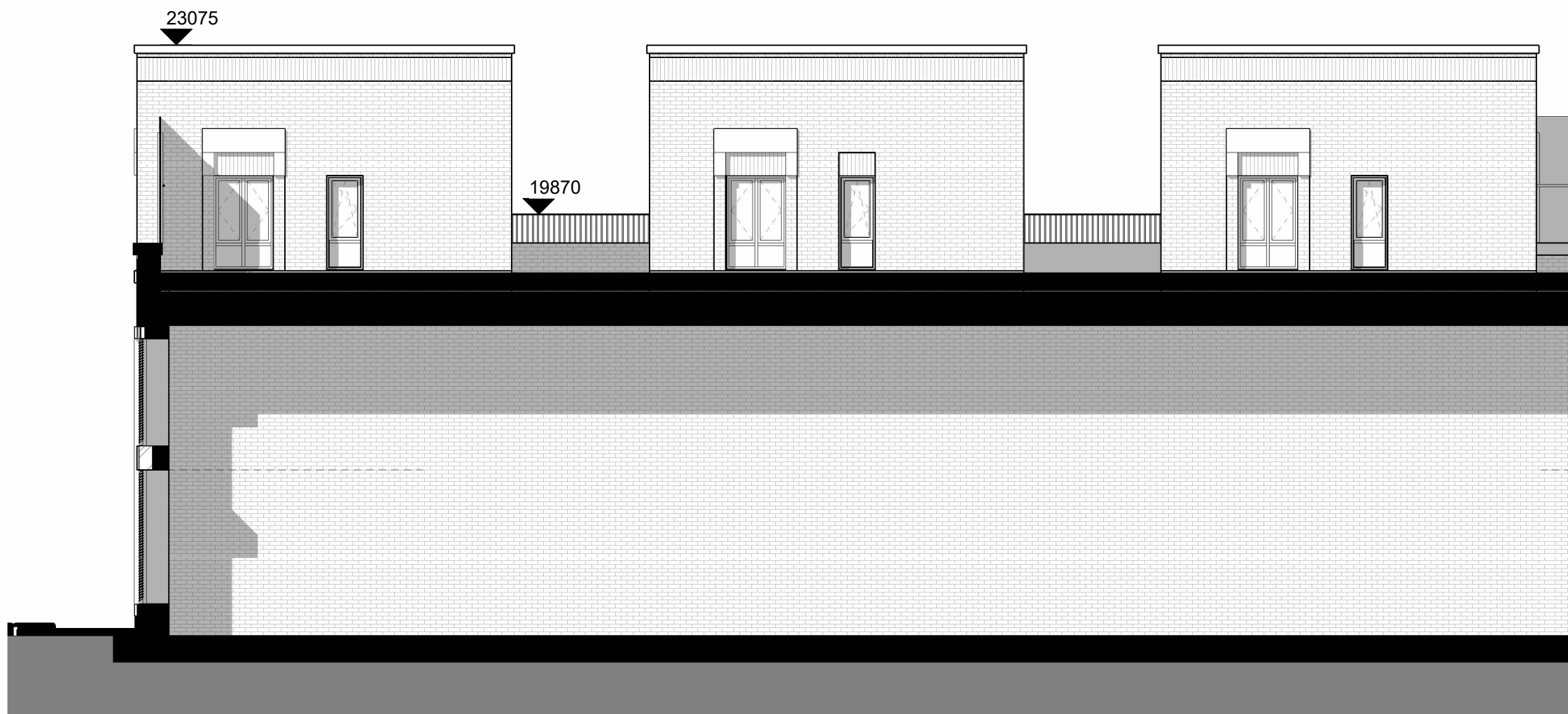
Proposed Plot A Block 3 East Elevation 1 : 100