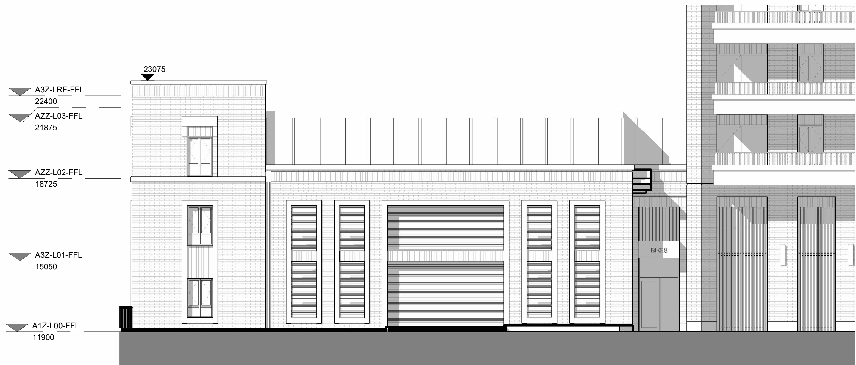
Proposed Plot A Block 3 North Elevation 1 : 100