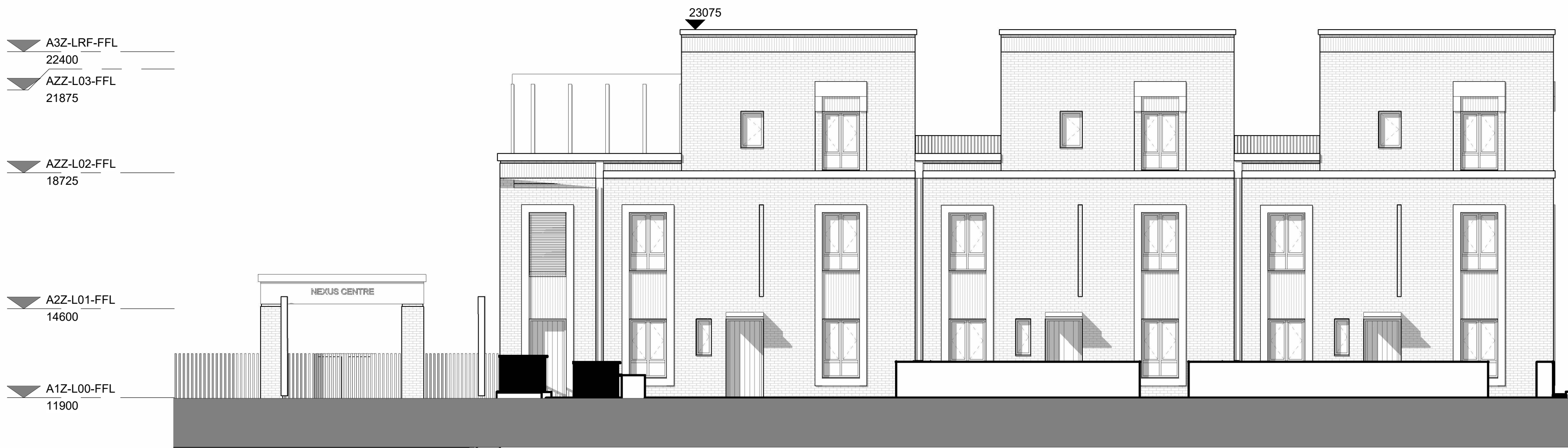
BProposed Plot A Block 3 West Elevation 1 : 100