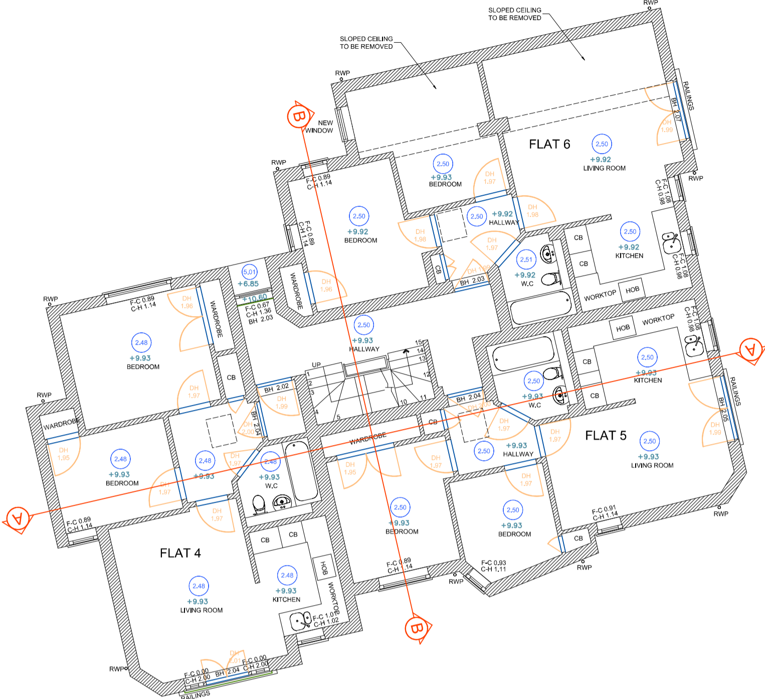
Proposed First Floor Plan 1:100