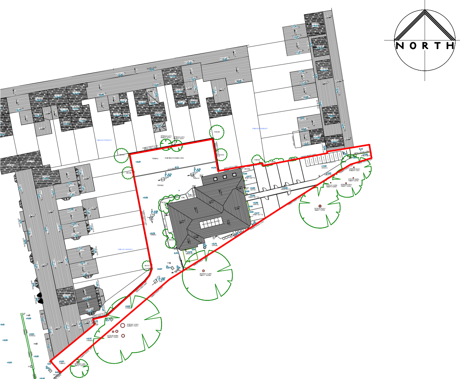
Proposed Block Plan 1:500

This drawing is prepared solely for design and planning submission purposes. It is not intended or suitable for other Building Regulations or Construction purposes and should not be used for such. Contractors must check all dimensions on site, Architect to be notified of any discrepancies in figured dimensions. No part of this drawing should be reproduced in any manner without written permission of M P Architects LLP except for the use it was created for.