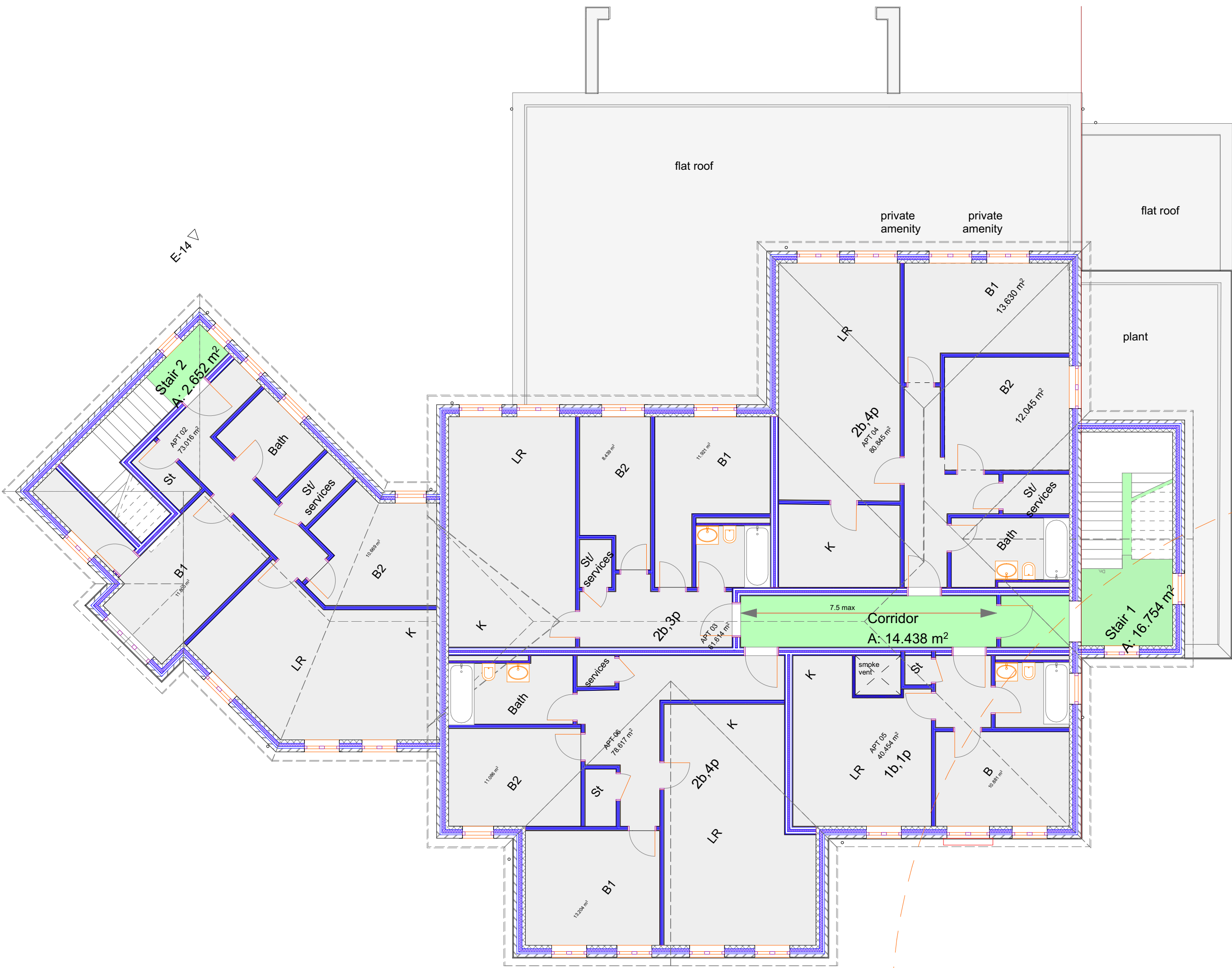
First Floor Proposed